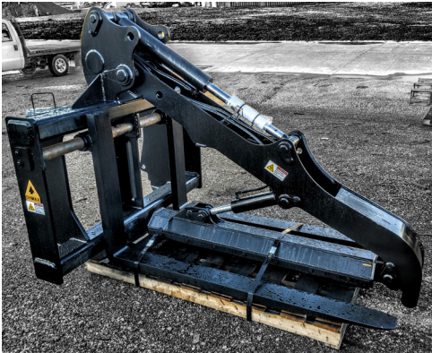
SINGLE CLAMP WL-40