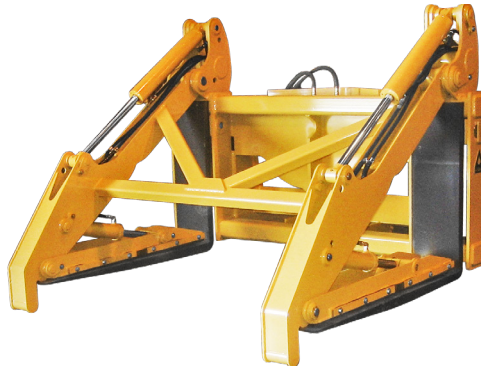
TWIN STABILIZER CLAMP WL-50 / WL-60 / WL-70 / WL-80