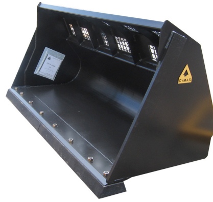
This 2.25yd 3 Dymax Refuse bucket with rubber edge is ideal for Front Loader Backhoes working in transfer station applications.