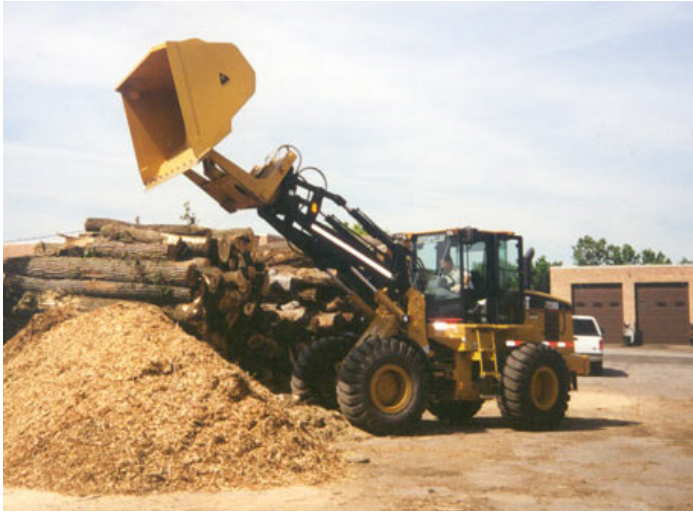
DYMAX Rollout Buckets are excellent for loading woodchips and chicken manure.