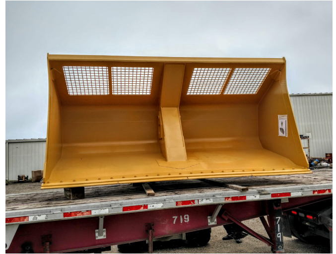
DYMAX Woodchip Rollout Bucket featuring integrated screen assembly. Custom solutions are available upon request.