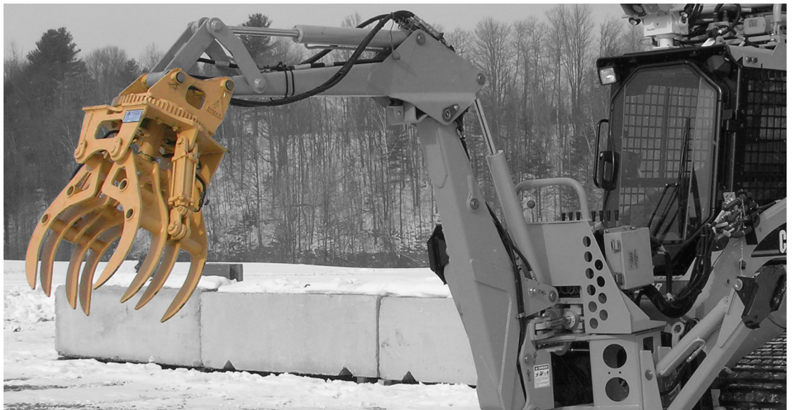
STEELTINE GRAPPLE 3T-5T