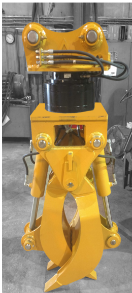
SEALED ROTATOR 12-14T

Dymax Hydraulic Rotating Grapples are ideal in scrap handling applications, construction sites, disaster cleanup and demolition cleanup. Perfect for contractors, cities and county highway departments, the Dymax rotation grapple works well in loading operations, separating and sorting materials.