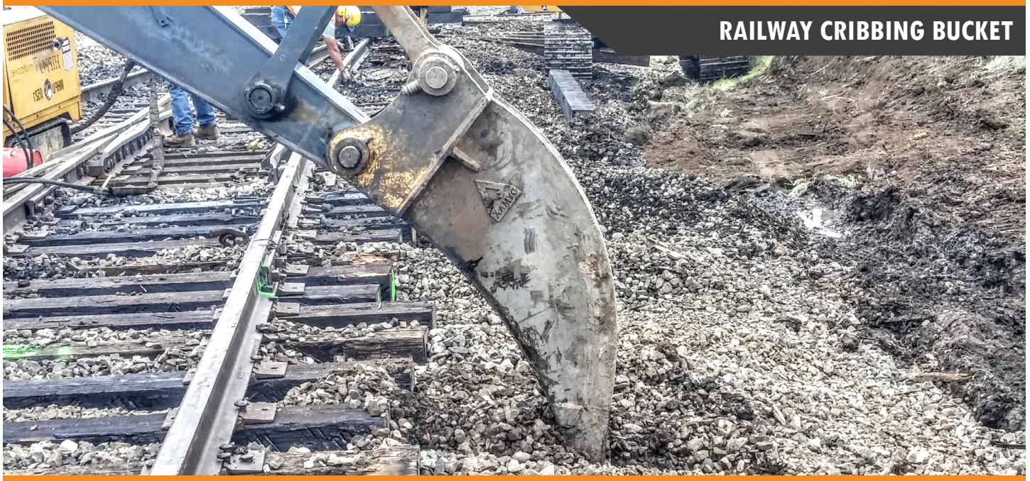
RAILWAY CRIBBING BUCKET