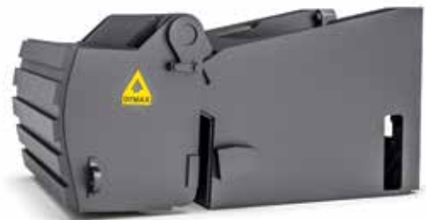
DX-BL-PBR CUSHION BLOCK-REAR MOUNT