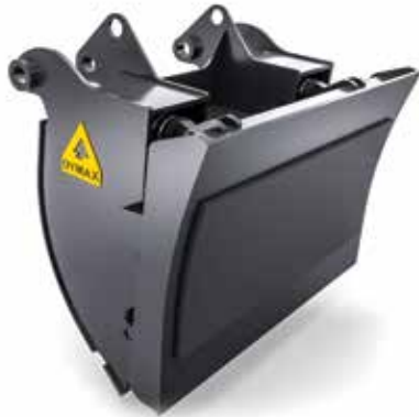
DX-BL-PBF CUSHION BLOCK-BLADE MOUNT