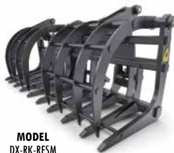
MODEL DX-RK-RFSM DX-RK-RFDG