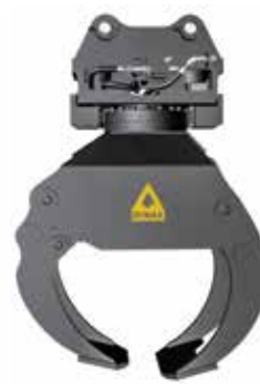
MODEL DX-GL-LG-HX DX-GL-LGPG-HX DX-GL-LGCP-HX