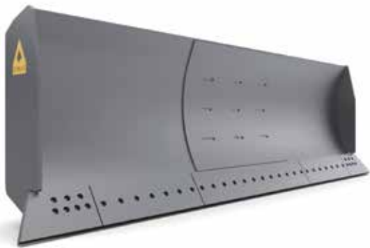
STRAIGHT BLADES WHEEL LOADER