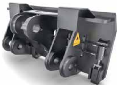
BLOCK HANDLING QUICK COUPLER