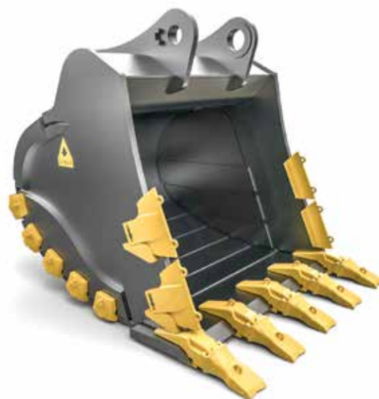
SEVERE DUTY ROCK EXCAVATOR 30-120T