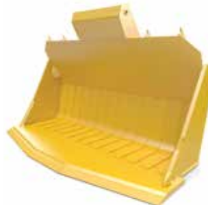
FLAT BOTTOM ROCK BUCKET