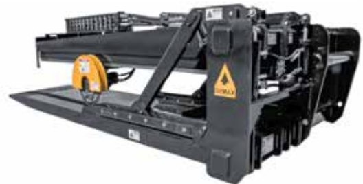
CONVEYOR BELT SAW