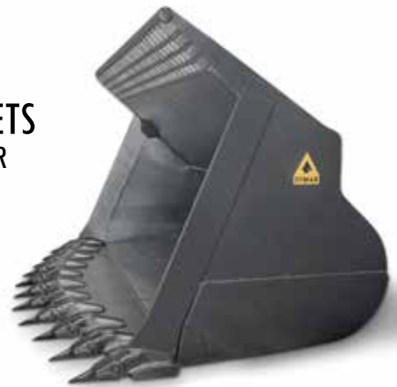
COAL BUCKETS WHEEL LOADER