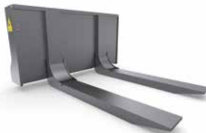
BLOCK HANDLING FORKS