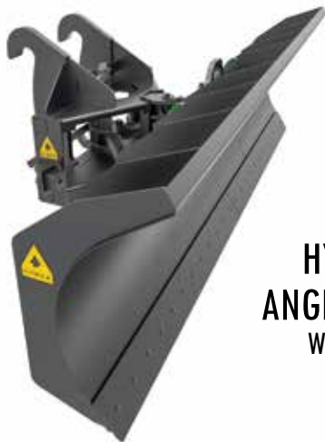
HYDRAULIC ANGLING BLADES WHEEL LOADER