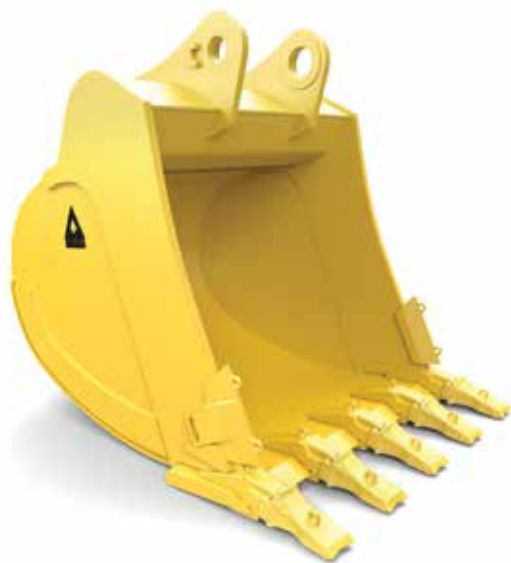
HD GENERAL PURPOSE EXCAVATOR 20-95T