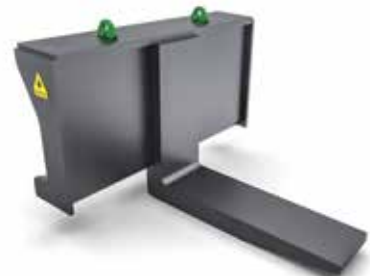
SINGLE BREAKER TINE FORK